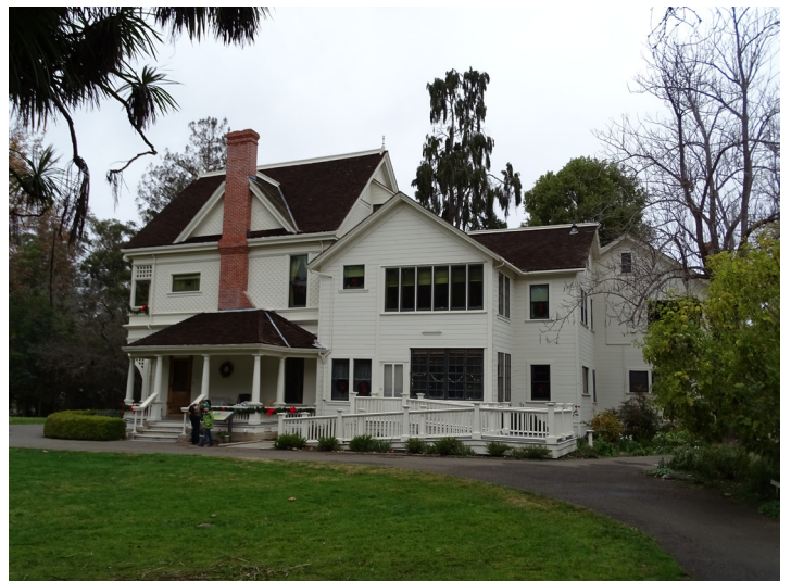
Patterson House at Ardenwood Farms