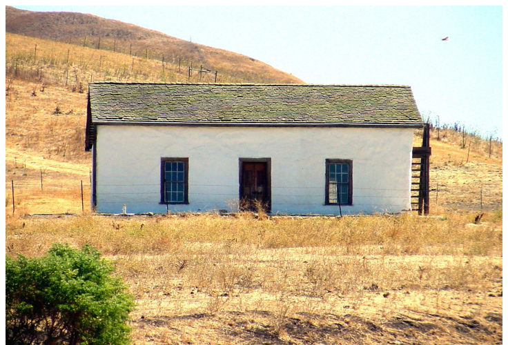
Higuera Adobe in Warm Springs