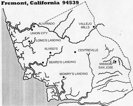
WASHINGTON TOWNSHIP 1853 - 2003

Washington Township Historical Society P.O. Box 3045 Fremont, California 94539