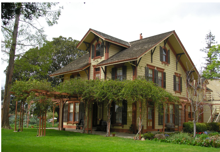
Shinn House on Peralta Boulevard