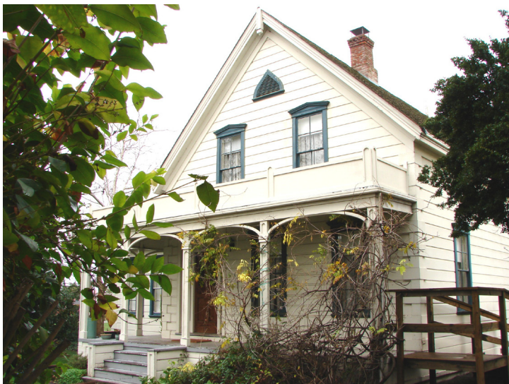
Harvey House, North Fremont