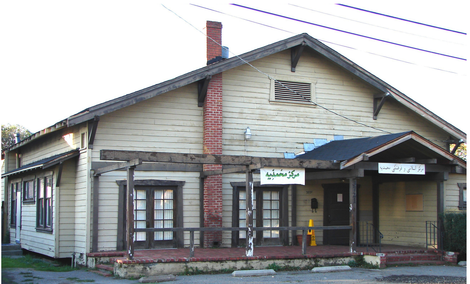
Country Club of Washington Township Women's Club