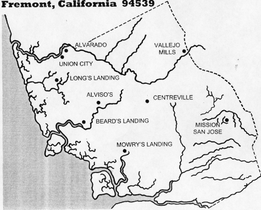
WASHINGTON TOWNSHIP 1853 - 2003

Washington Township Historical Society P.O. Box 3045 Fremont, California 94539