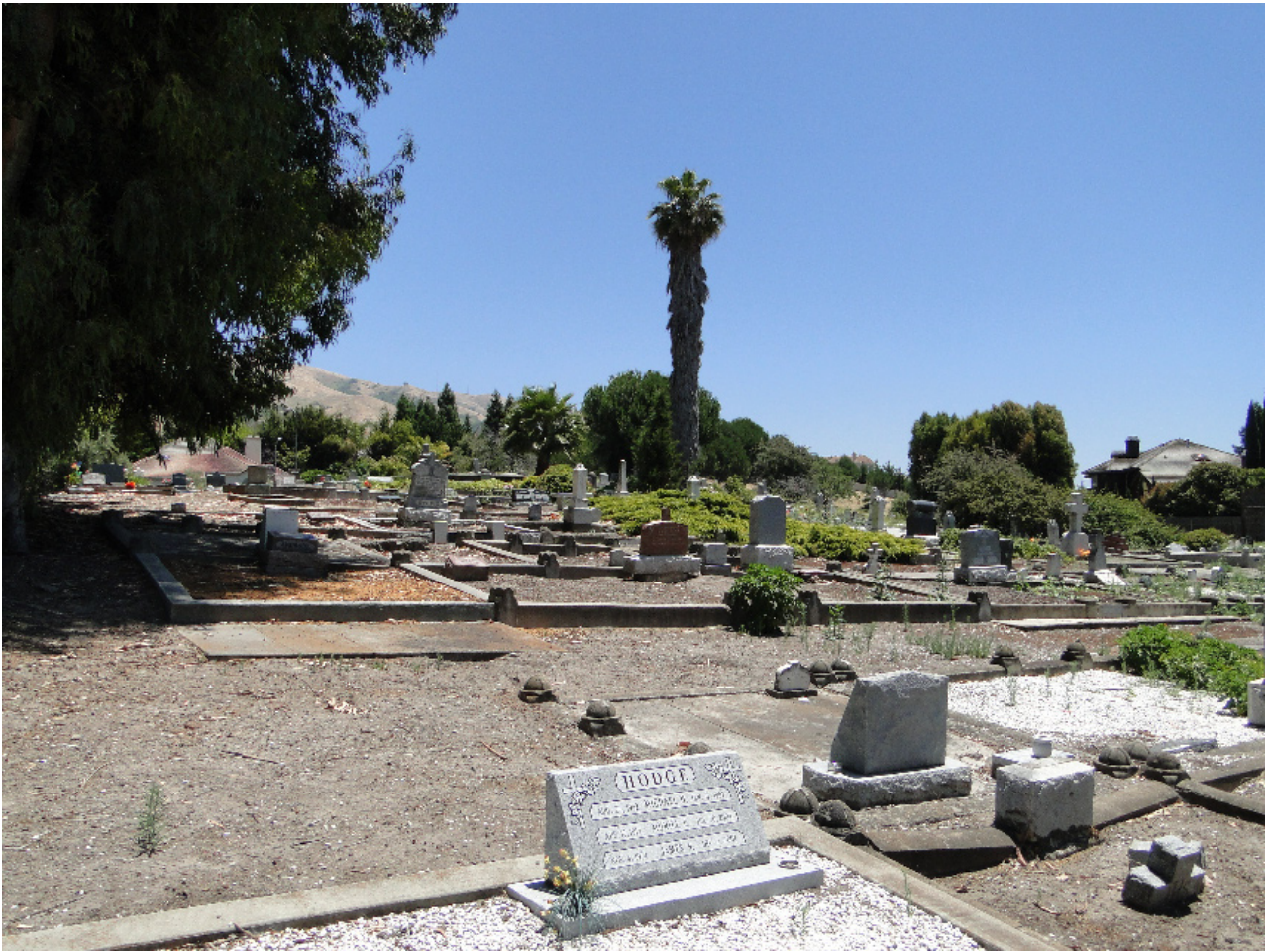
St. Joseph Parish Cemetery, Mission Blvd, Fremont

Washington Township Historical Society P.O. Box 3045 Fremont, California 94539