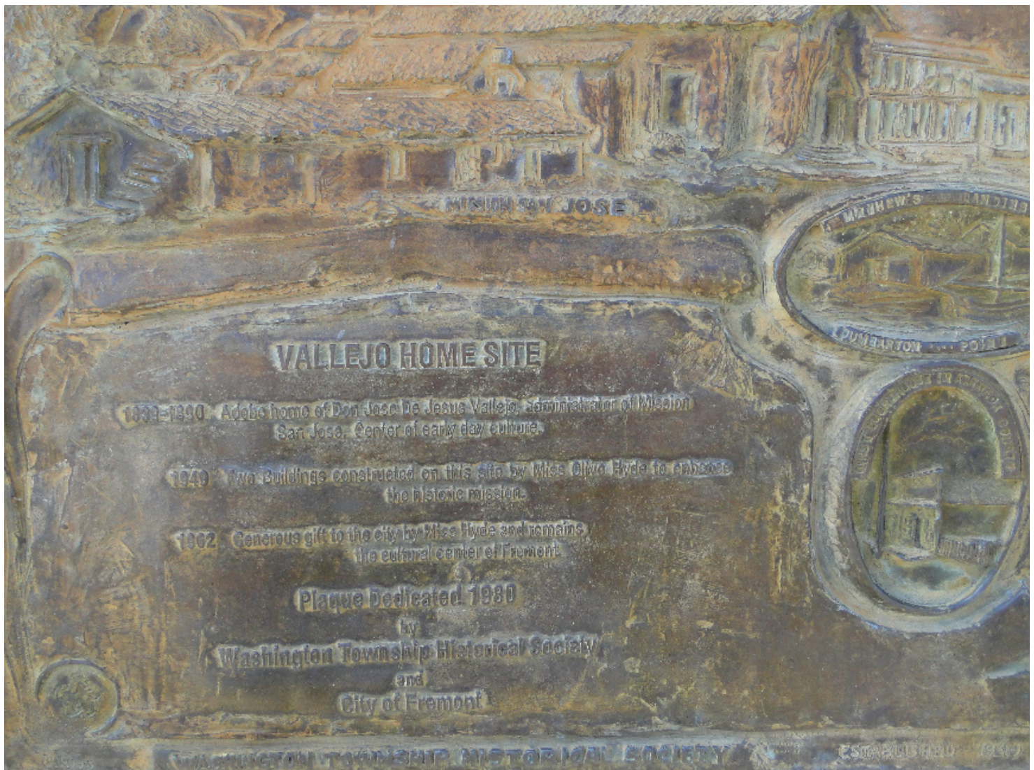
Washington Township Historical Plaque at Olive Hyde Art Guild, identifying this site as the Vallejo Home site