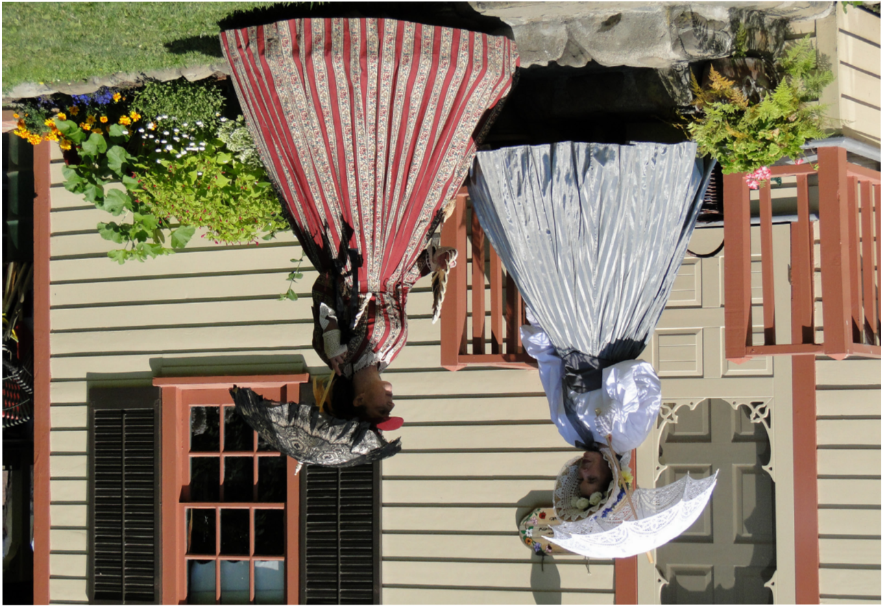
Victorian Models at the 1850's Sim Cottage at Shinn Park

Washington Township Historical Society P.O. Box 3045 Fremont, California 94539