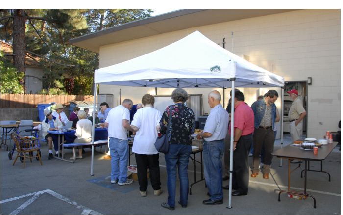
WTHS members at the food table