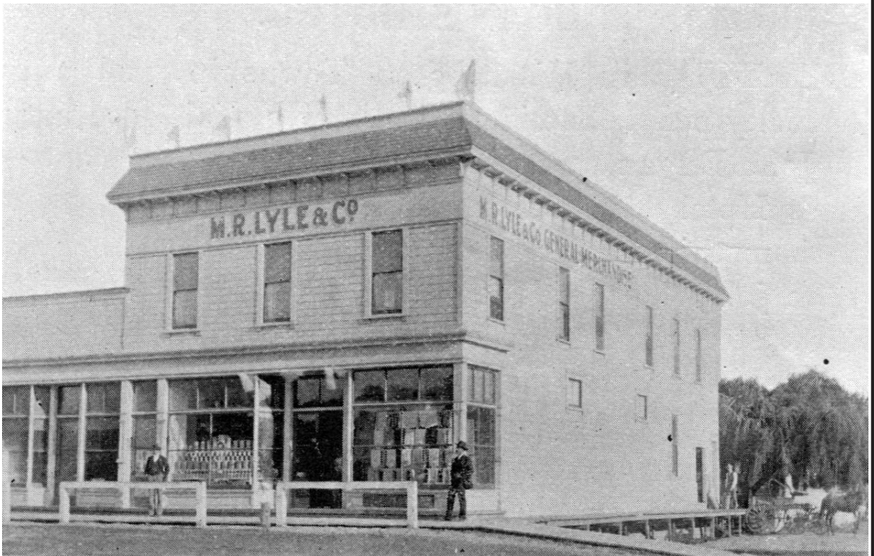
A picture of the Lyle building from about 1896

In 1976, Uncle Joe's Pizza opened in the lower part of the building and continued until 1996, when the business changed to Bronco Billy's Pizza.