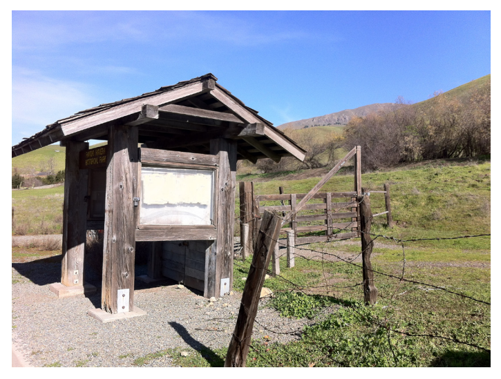
This is what it looked like when we started.