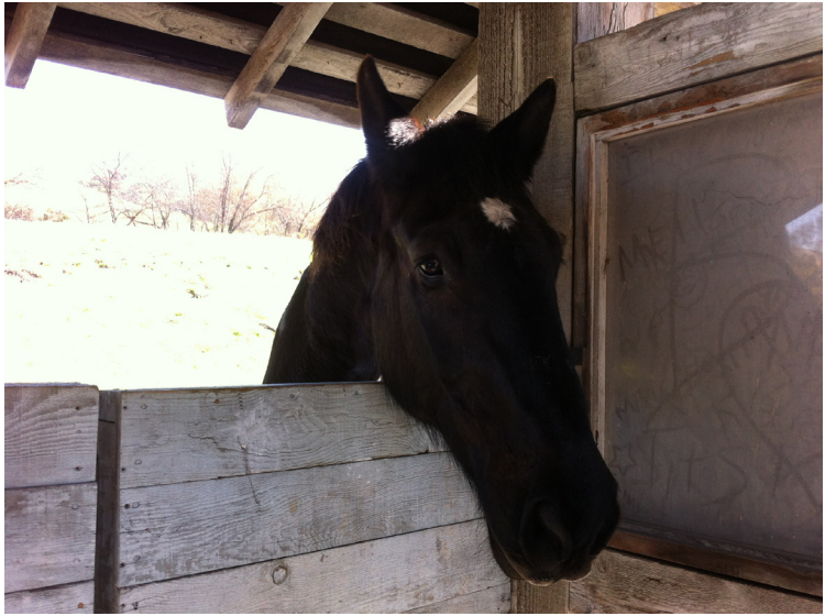
This is our sidewalk (corral) superintendent.