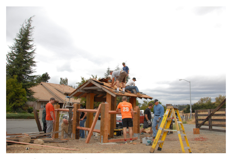
The work continues.